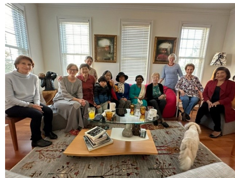
September Trip to the Frances M Maguire Art Museum, PAFA Rising Sun exhibit in October and November Diwali Potluck

The objective of the IWCP is to welcome women of all cultures to the Philadelphia area and to promote friendship, cooperation and understanding without political agenda and self-promotion of businesses.